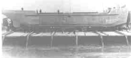
MOLLINETTE before launch.