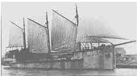
MOLLINETTE under sail.